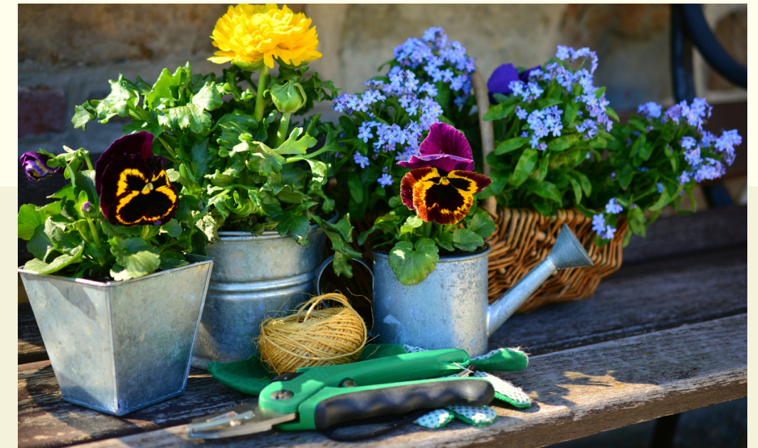
John Adams Middle School