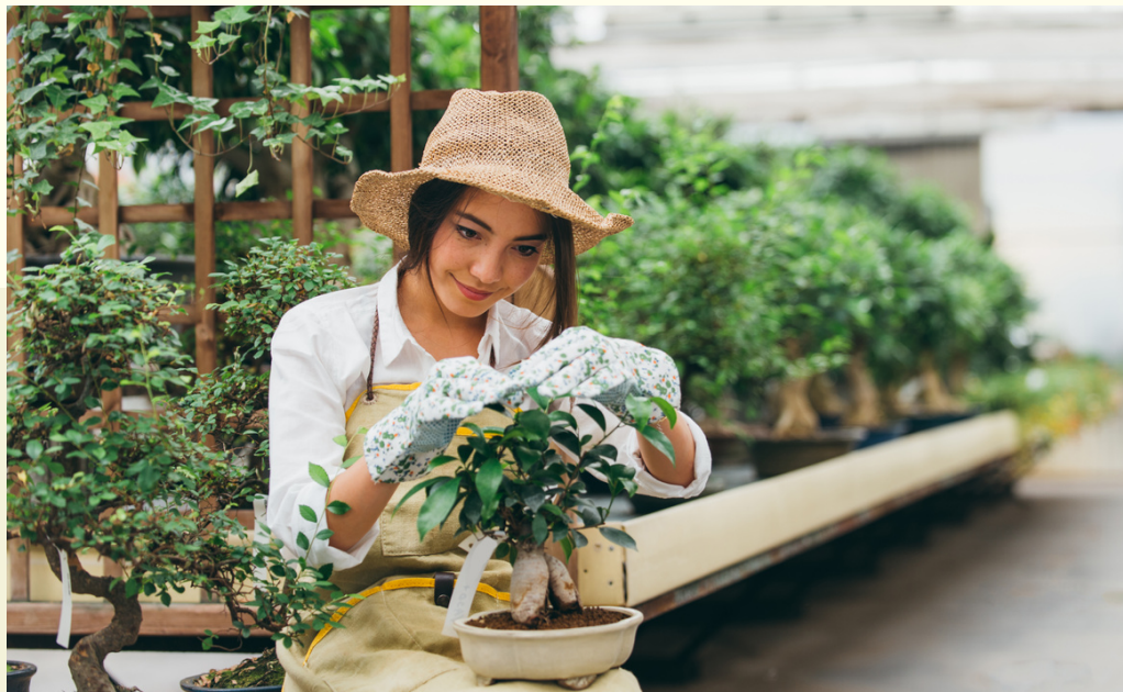
Polk Elementary School

Each community school that receives a kit will also fill out a quality improvement survey at the beginning and end of the initiative to measure quality of implementation and outcomes.