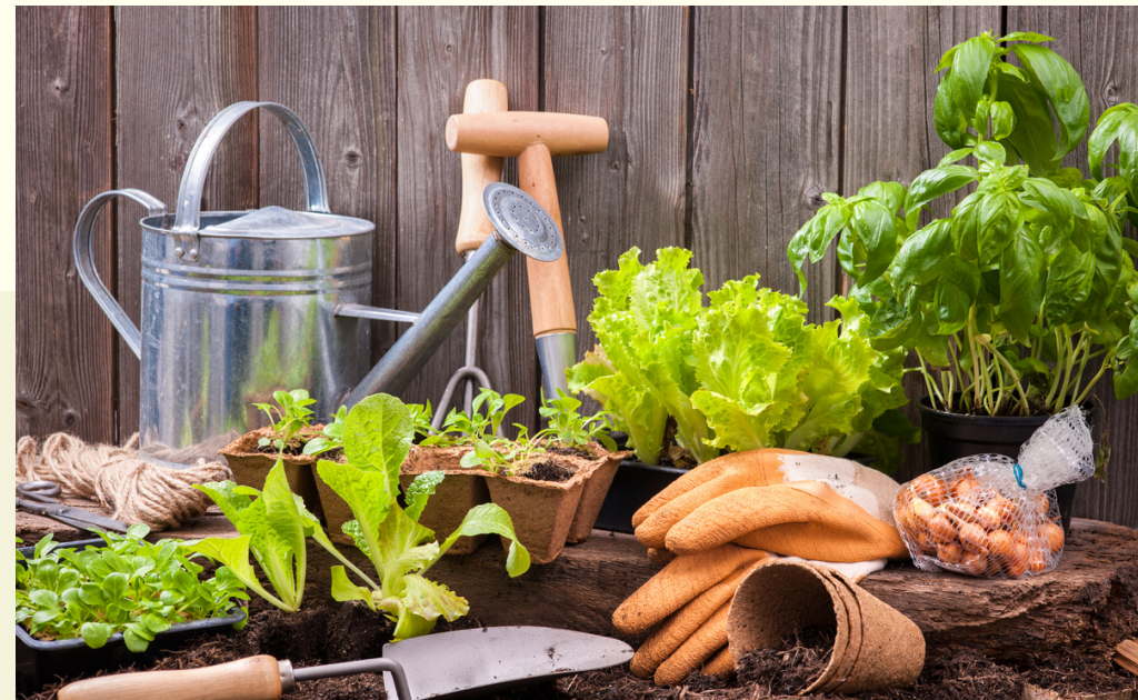
Native American Community Academy