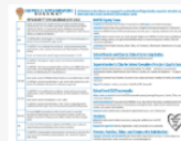
NMPED CLR Framework Roadmap Revised (PDF)